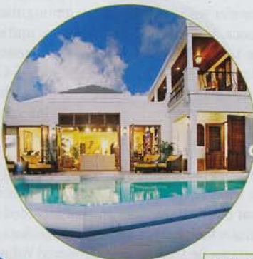
U.S. VIRGIN ISLANDS

St. Croix: Plenty of light and sun in a spacious 2BR, 2.5BA home with infinity pool, ocean views, footpath to beach, super-private location, daily housekeeping. From $5,500/week. Contact Nancy Anderson, McLaughlinAnderson@LuxuryVillas.com .