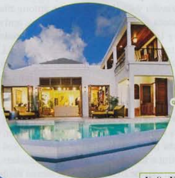
U.S. VIRGIN ISLANDS

ISLAND VIEWS St. Croix: Plenty of light and sun in a spacious 2BR, 2.5BA home with infinity pool, ocean views, footpath to beach, super-private location, daily housekeeping. From $5,500/week. Contact Nancy Anderson, McLaughlin Anderson Luxury Villas.