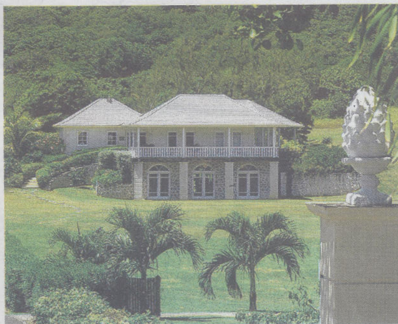
ELEGANCE: The Cotton House on Mustique is set among landscaped gardens

The fine-dining Veranda Restaurant is one of the best in the West Indies with signature dishes such as sea bass carpaccio with Venetian caviar. Getting there: Prestbury Travel Group (01625 855840/www.prestburytravelcaribbean.co.uk) offers seven nights at the Cotton House from £1,460pp (two