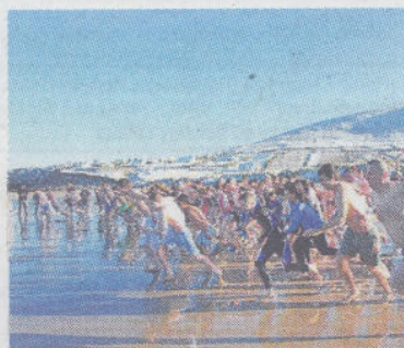
BRACING: New year bathers at Achill

dramatic landscapes and seascapes it's all here. Take a drive along the coast to Keel village to view the magnificent Minaun Cliffs. There are also must-see archaeological, geological and historical sites including the striking Cathedral Rocks beneath Slievemore mountain and the famous Deserted Village - the ruins of